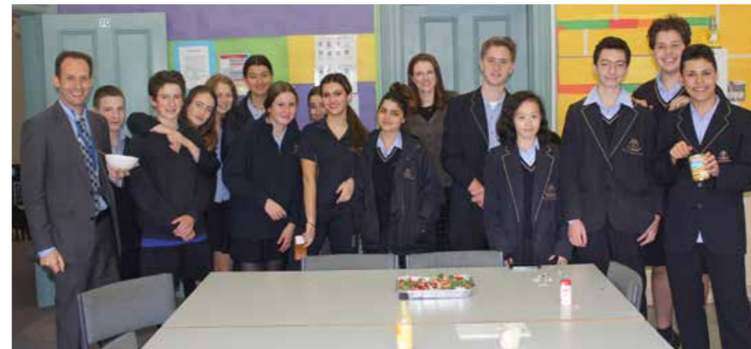
LEFT: In their Wellbeing classes, Year 10 students looked at the Australian Dietary Guidelines for teenagers and created delicious nutritious salads that were a healthy balance of different foods.