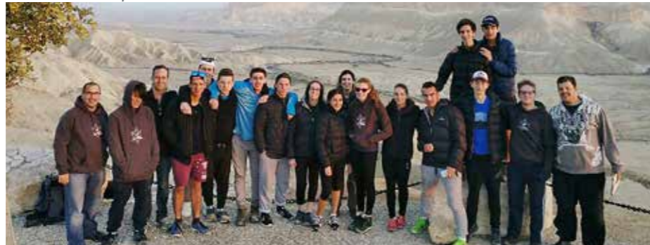
Yesh 2016 Participants